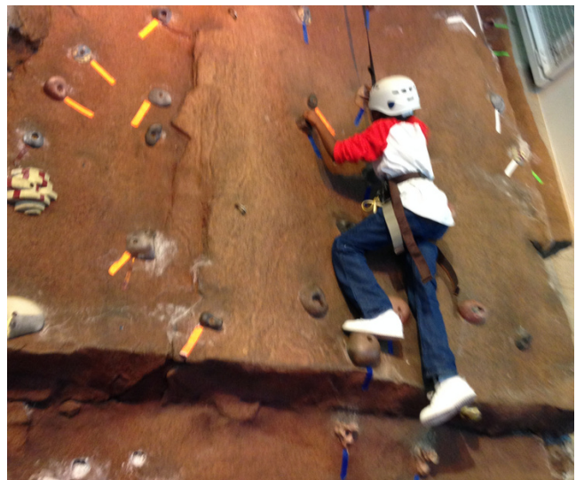
End of the Year Student Celebration