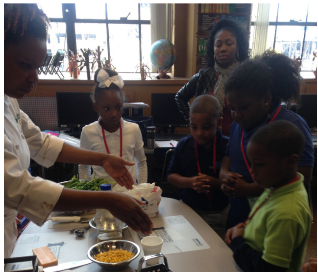
Cooking Matters Session