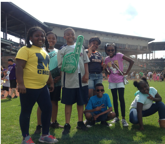
United Shore Professional Baseball League (USPBL) Game

Our collaboratively rich programs ignite a passion for education that inspires students to thrive academically. We provide safe spaces and intentional learning structures where students connect with dedicated mentors for guided, specified literacy interventions. We pave the way for community contribution towards children's lifelong love of learning through reading.